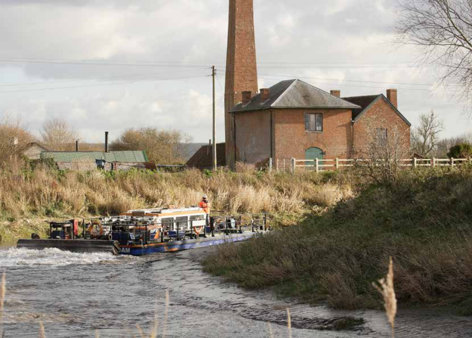
Water injection dredging