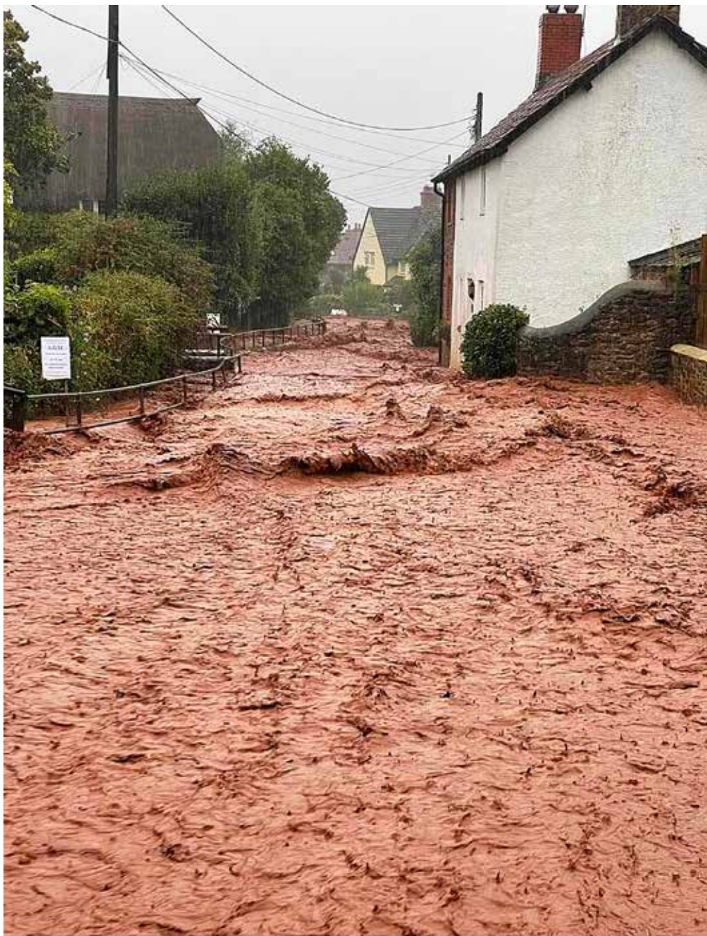
West Somerset, September 2023

These cases of flash flooding followed earlier incidents in the 2020s in places such as Croscombe, Chard, Ilminster and Milverton.