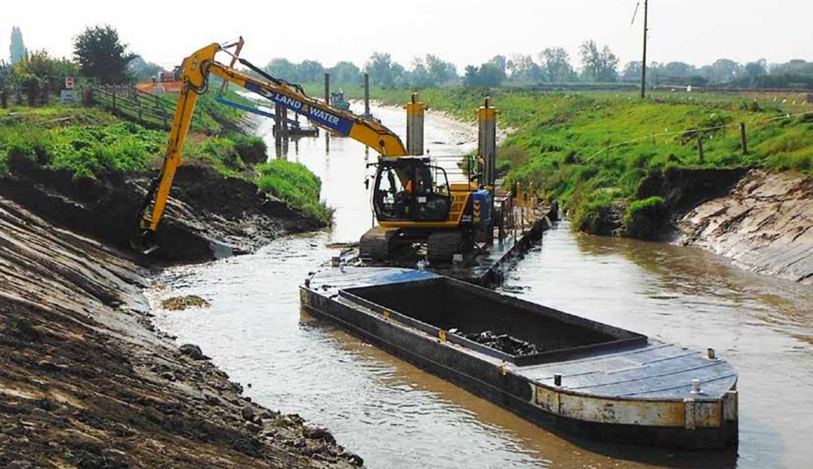
Dredging in 2014