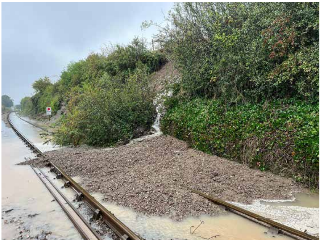
West Somerset Railway line, September 2023

What we cannot know is what exactly is going to happen where and when. We will therefore need to plan and prepare more in ways which explicitly seek to take into account increased uncertainties and unpredictabilities. A more flexible kind of readiness will be required. Programmes of work should ideally be agile enough to allow for different actions to be taken at times when evidence from a changing world and changing climate suggests they will be most effective. Not too early, not too late, but as carefully judged as possible to reduce flood risks, to help people cope with flooding if flooding does occur, and to adapt successfully when need be.