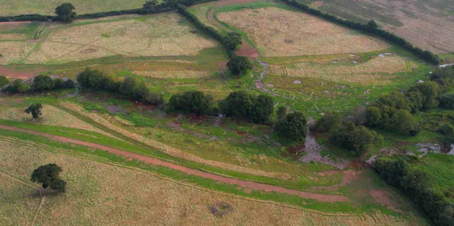
River Aller works